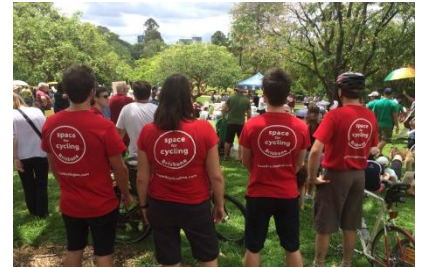
Nice T Shirts – you too can own one $20 each – contact us.

It has been a busy few months since some of Brisbane's Bicycle Groups got together and decided it was time riding a bicycle became a political issue in the next local government elections. Those elections on March 19 th 2016 are coming around pretty quickly so the team at Space for Cycling Brisbane has been talking to as many people as possible about the campaign and getting the message out there.