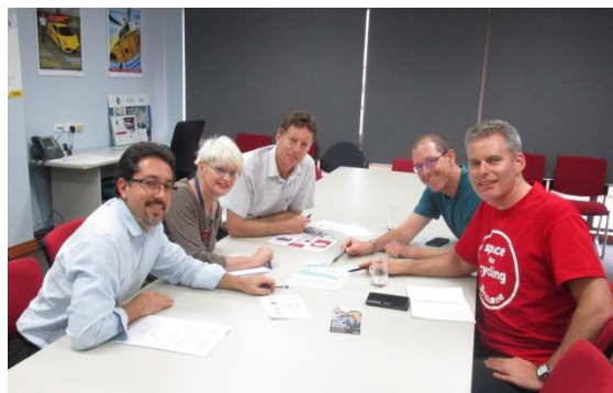
Space for Cycling Team met with RACQ - they love protected bike lanes