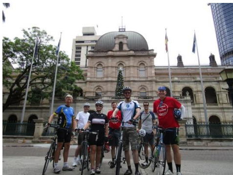
North side bike riders take Hon. Mark Bailey for a tour- it was hot and they talked a lot as well as looked at the good and the bad of the north side.

We also felt it was important to gain support and inform other interested organisations about our campaign and to date we have met with or contacted RACQ, The Heart Foundation, The Cycling Promotion Fund, Bicycle Queensland, and the Minister for Main Roads. We were pleased to be able to take the Minister for a bicycle ride on the north side of Brisbane to show him some of the issues facing people who ride bicycles.