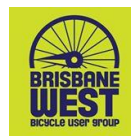
Brisbane West BUG